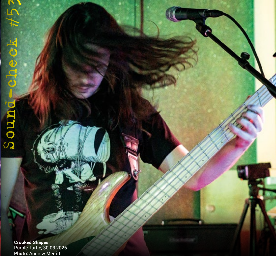
Crooked Shapes Purple Turtle, 30.03.2026

E vening! It's May again, then, and you know what that means; the weird and wonderful time of year when, for two days only, there are bands on at Sub89 that aren't pretending to be somebody else and it's completely normal to say "I'm going to the church to get a beer and watch Adult DVD ". Yes, folks! It's Are You Listening? Festival time!