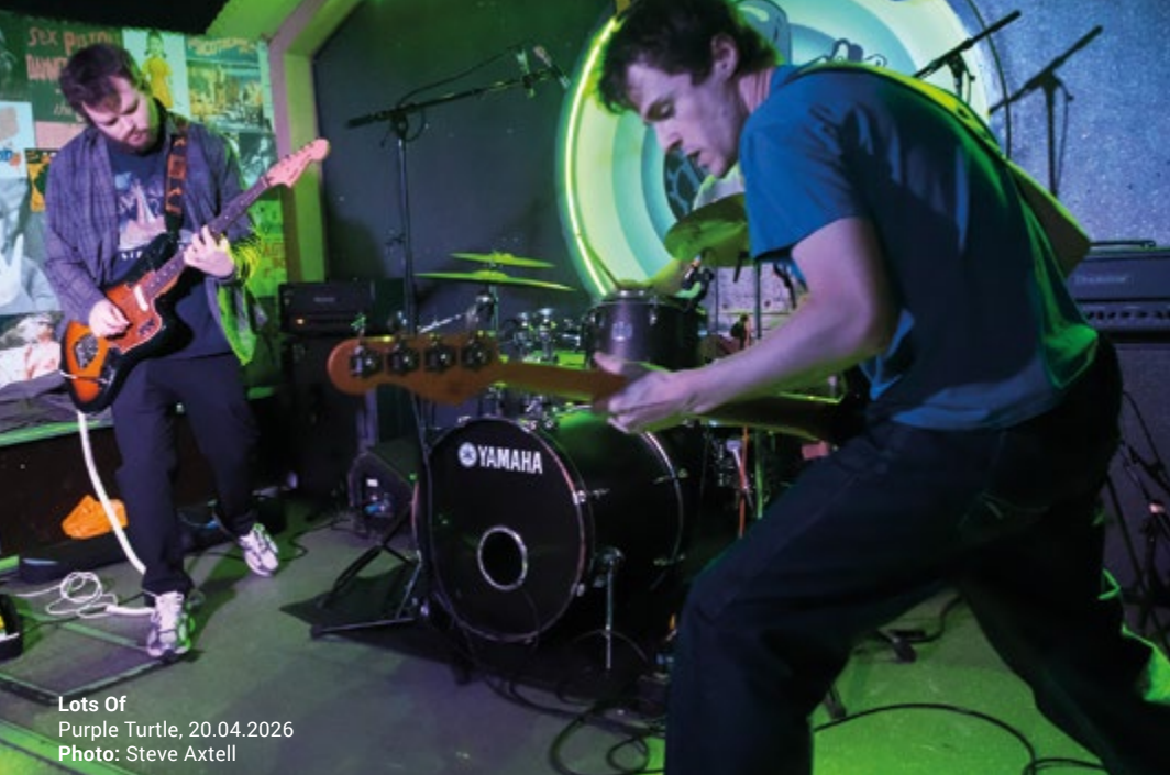
Lots Of Purple Turtle, 20.04.2026