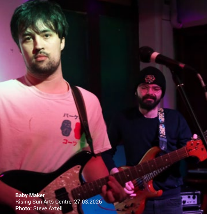
Baby Maker Rising Sun Arts Centre, 27.03.2026