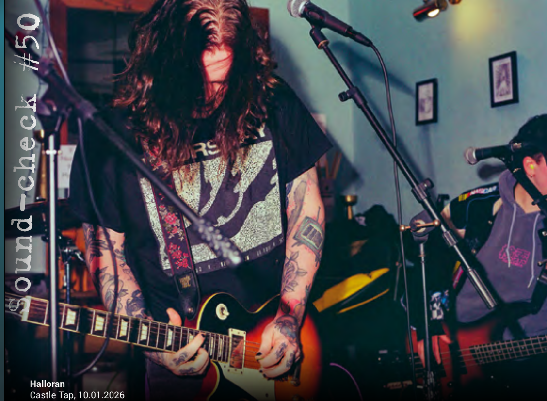
Halloran Castle Tap, 10.01.2026

"Yeah, ok. I'll do a live gig guide for Reading. I'll try it for one year and see how it goes. No promises." That's what I said in 2019. Then, six months later, everything everywhere closed down and nobody was allowed out to play... and when we were, eventually, allowed out everything was bugged, an entire world of live music that already relied on self-employed and underpaid people felt in danger of giving up and just leaving it all to Tribute Band plc... trying to encourage people out to remember the joys of before just seemed really important so I started it up again... Well, we're still doing it and guess what. We've only gone and reached issue 50, haven't we! A half-century. Flippin' eck!