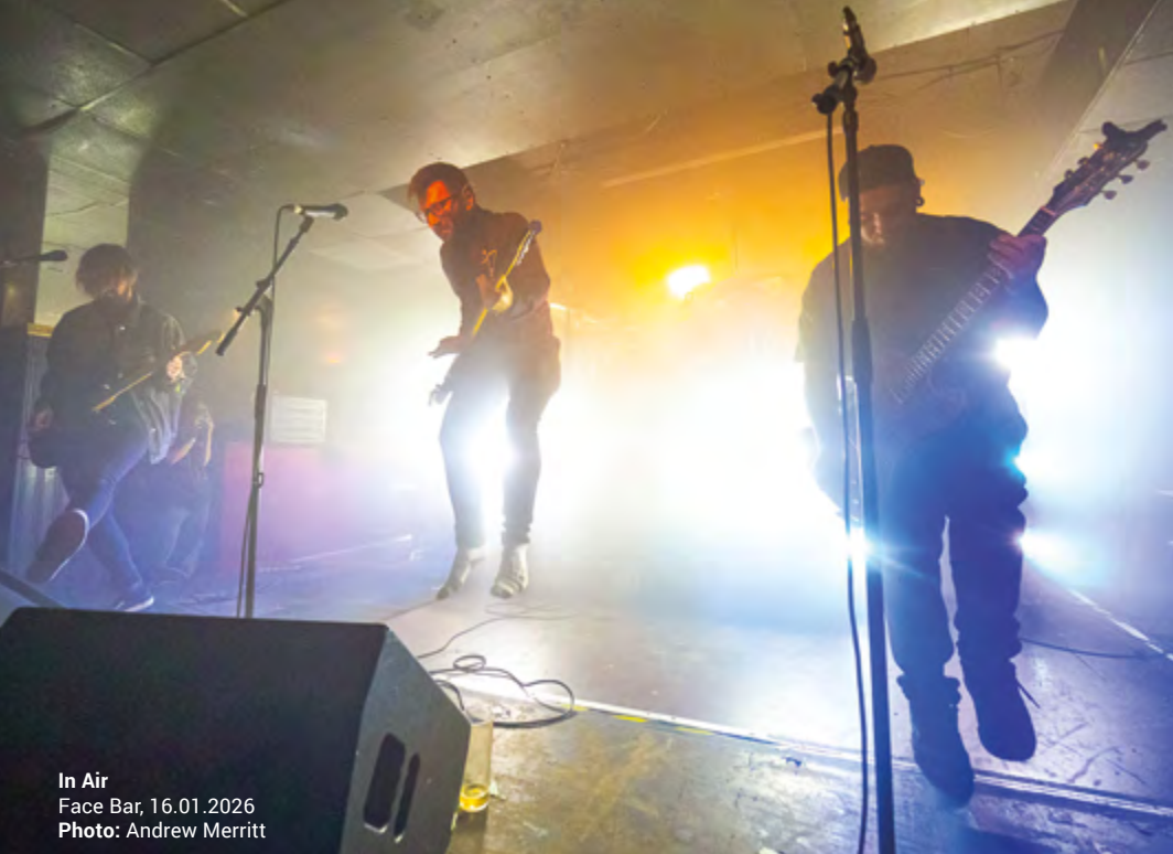
In Air Face Bar, 16.01.2026