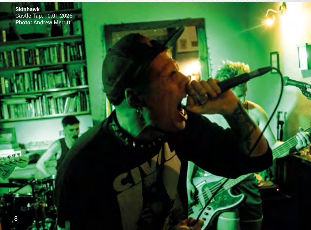
Skinhawk Castle Tap, 10.01.2026

Email listings info to copy@sound-check.co.uk