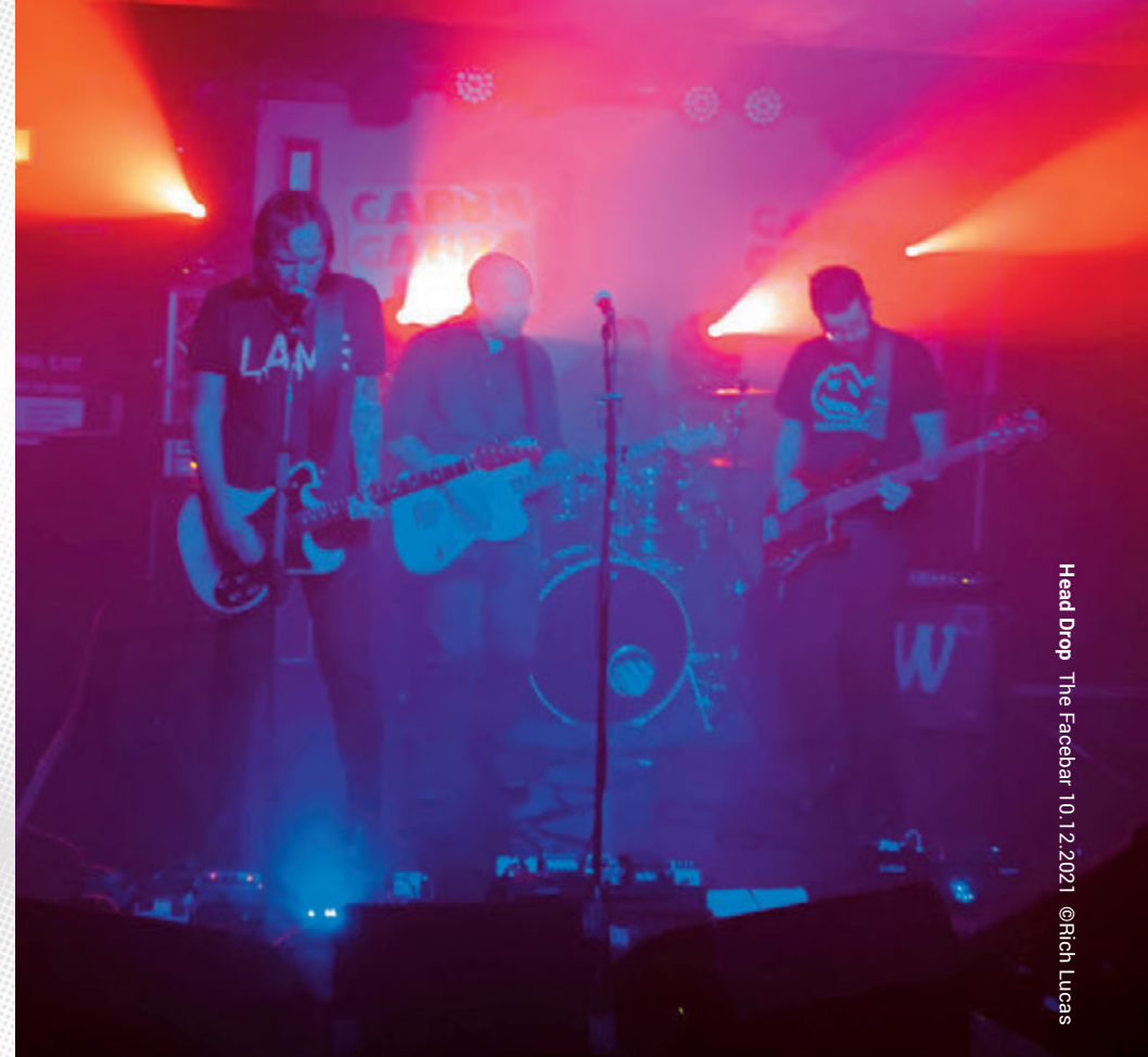
Head Drop The Facebar 10.12.2021