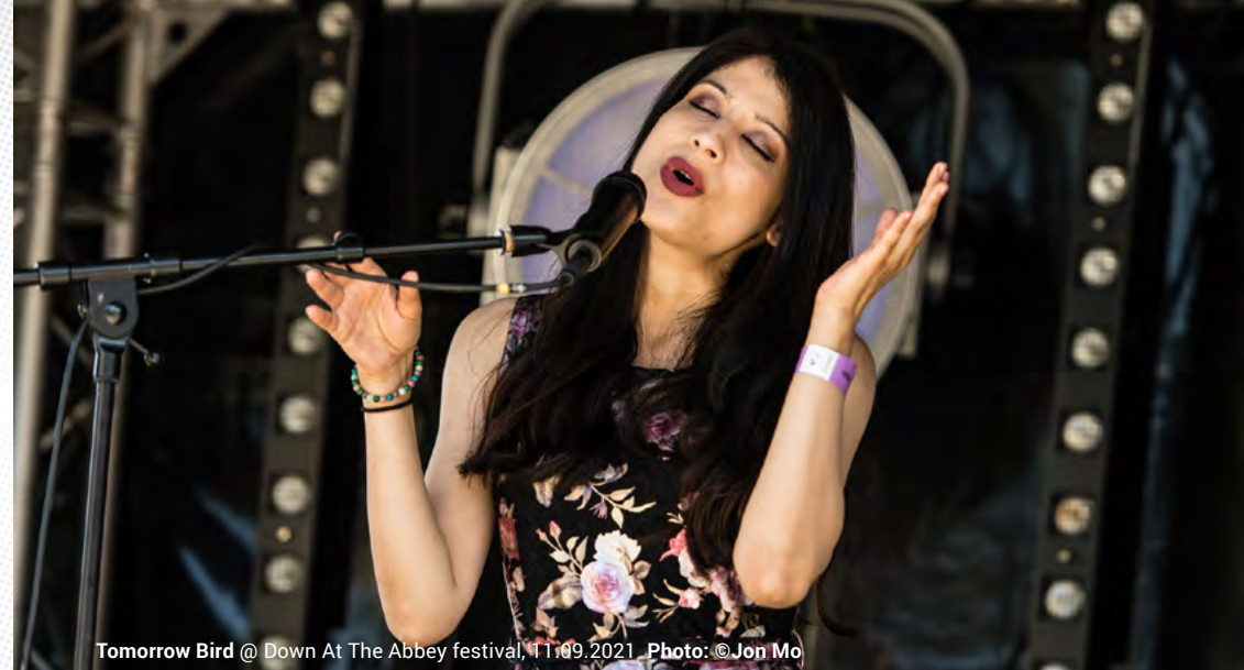
Tomorrow Bird @ Down At The Abbey festival, 11.09.2021