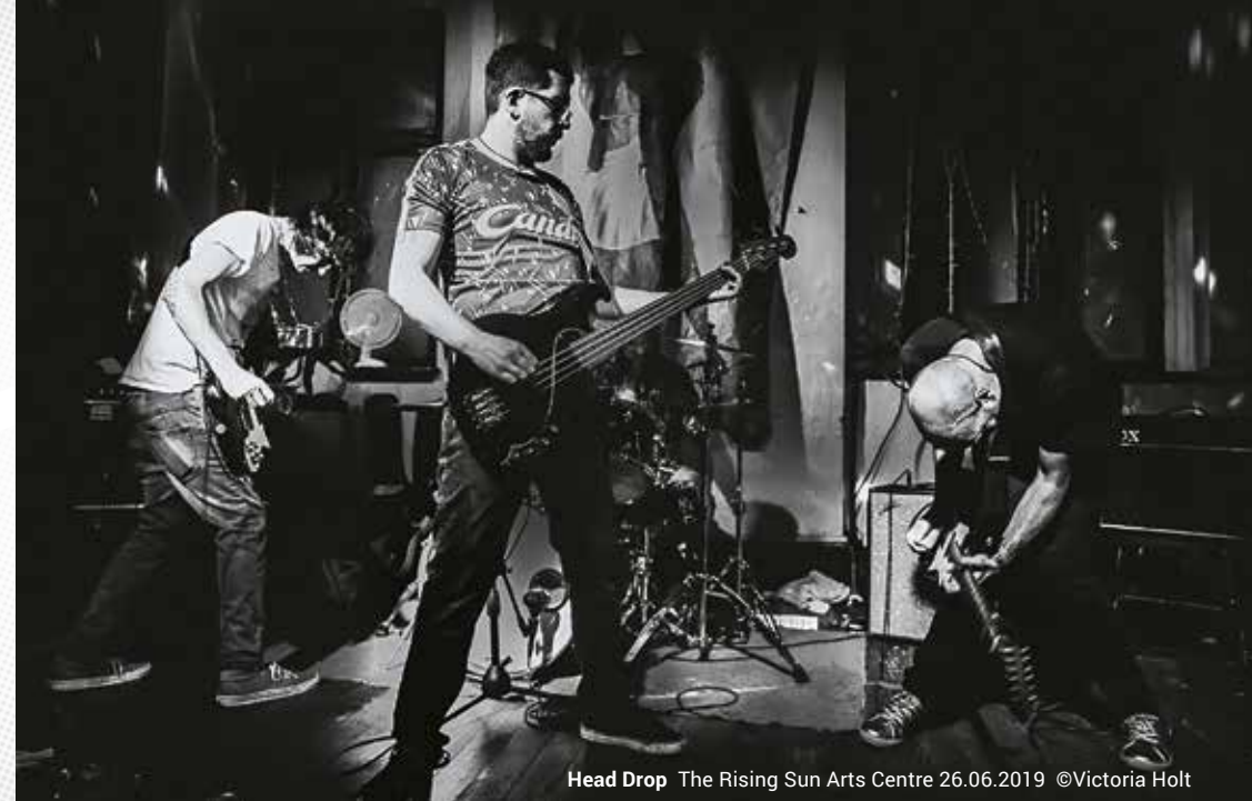
Head Drop The Rising Sun Arts Centre 26.06.2019

SUB89 The MJR Group presents China Crisis 7pm | £22 + booking fee | 14+ eventbrite.co.uk