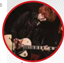
The Keep Cats Readipop Festival 14.07.2019

If you'd like to contribute something, send it to copy@sound-check.co.uk